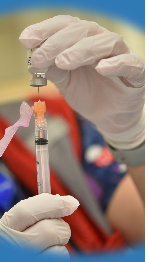
MultiCare Capital Medical Center Community Health Needs Assessment Implementation Strategies 2022