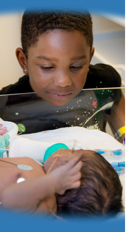
MultiCare Capital Medical Center Community Health Needs Assessment Implementation Strategies 2022